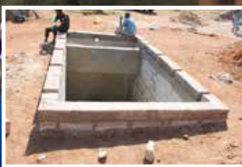
The toilet blocks in various stages of construction